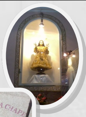
The image and chapel of Sto. Niño de Marikina,

Sto. Niño community is one of the chapel community of Our Lady of Abandon parish in the diocese of Antipolo and it belongs to the barangay Sto. Niño, Marikina City.